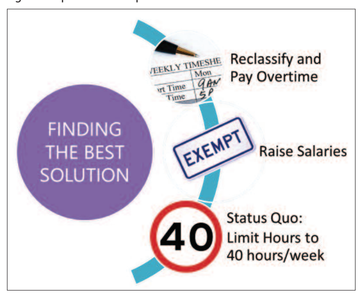
Figure 2: Options for Compliance

experienced colleagues earning overtime/comp time or not being required to work overtime, thus increasing the demands on the exempt employee? Raising salaries to the minimum threshold avoids overtime and maintains certainty for monthly salary obligations. Beyond the issue of how these increases are funded is the potential for salary equity issues when less experienced employees received salary increases while those currently earning above the threshold do not.